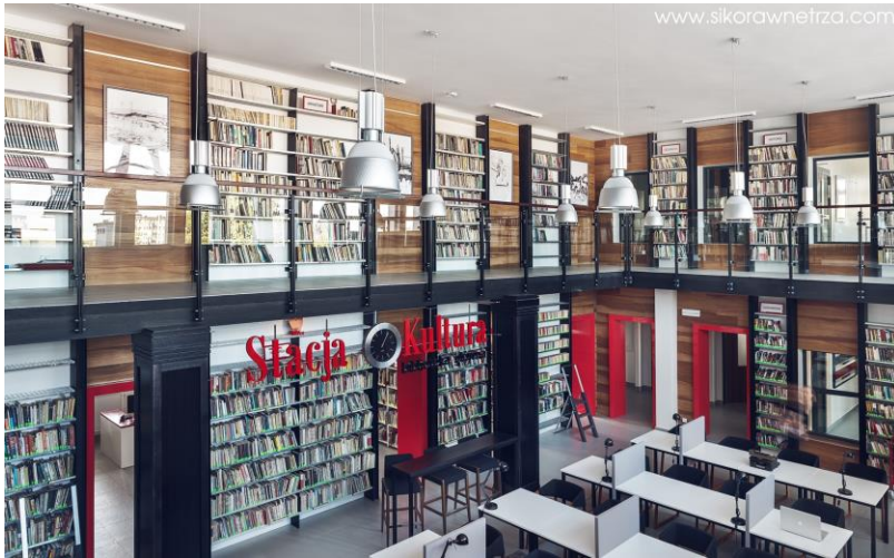
Library in Rumia, visualisation: Sikora Wnętrza