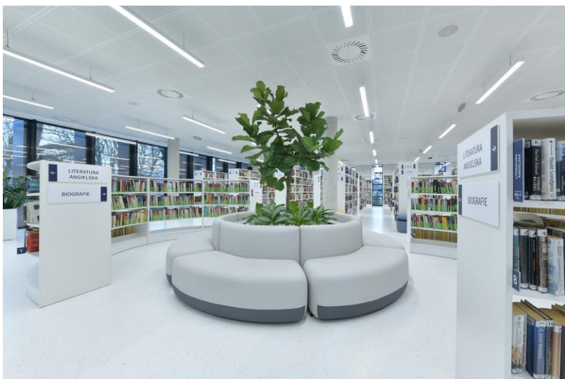
Library in Redzikowo, photo: library's own materials