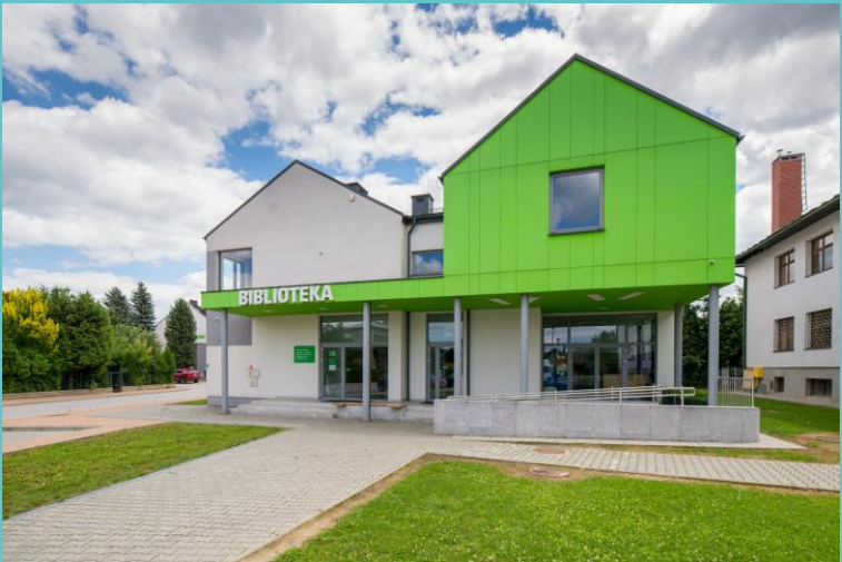
Library in Gołkowie, photo: R. Kubik