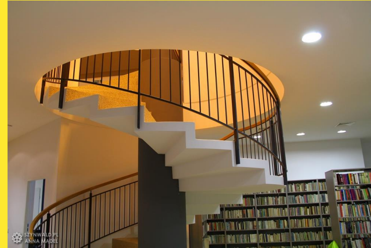
Library in Szywałd