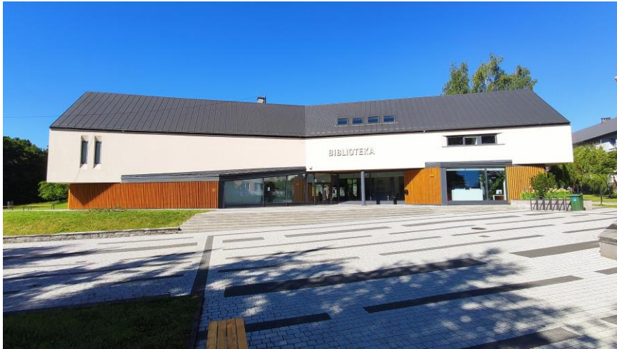
Library in Szywałd (small village in Southern Poland)