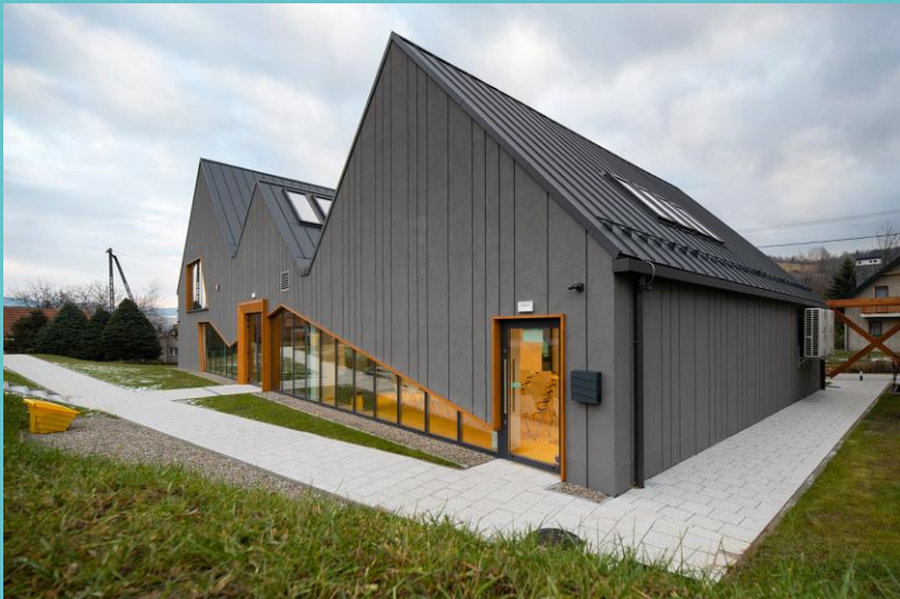
Library in Przysietnica, photo: R. Kubik