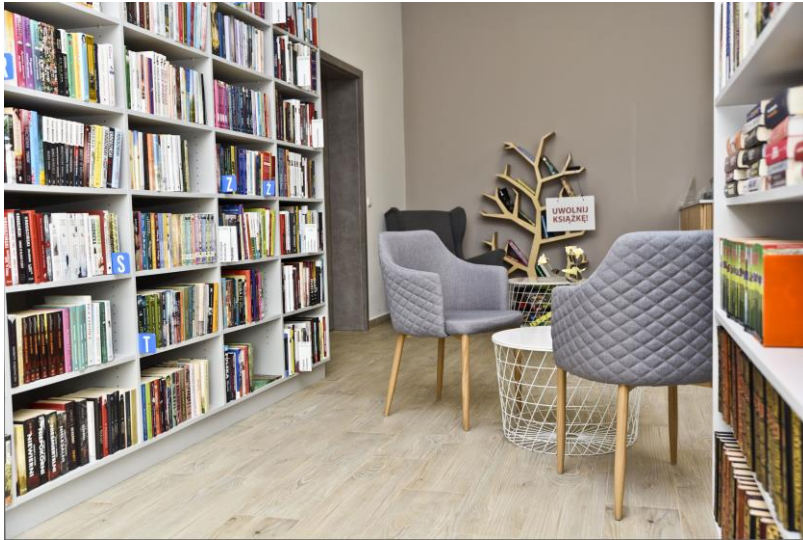
Library in Redzikowo, photo: library's own materials

In terms of its financial scale, the National Reading Development Programme represents the largest multiyear programme run by the Ministry of Culture and National Heritage in cooperation with the Ministry of Education and Science .