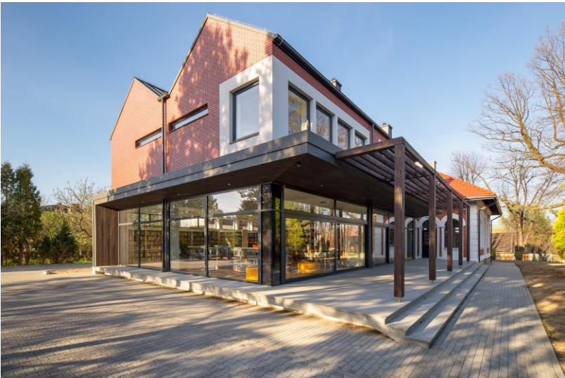
Library in Stary Sącz