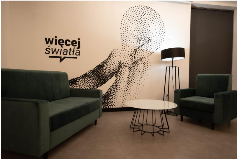
Library in Jarocin