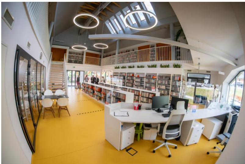
Library in Przysietnica