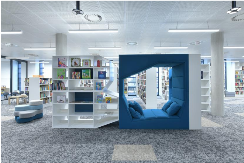
Library in Redzikowo