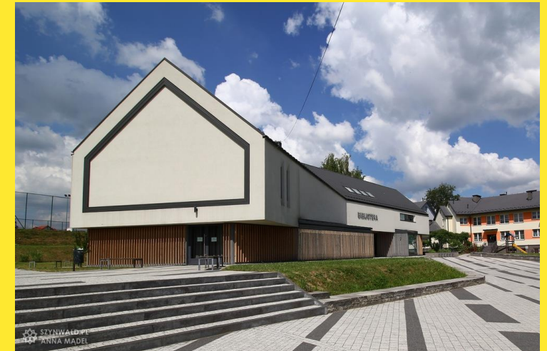
Library in Szywałd