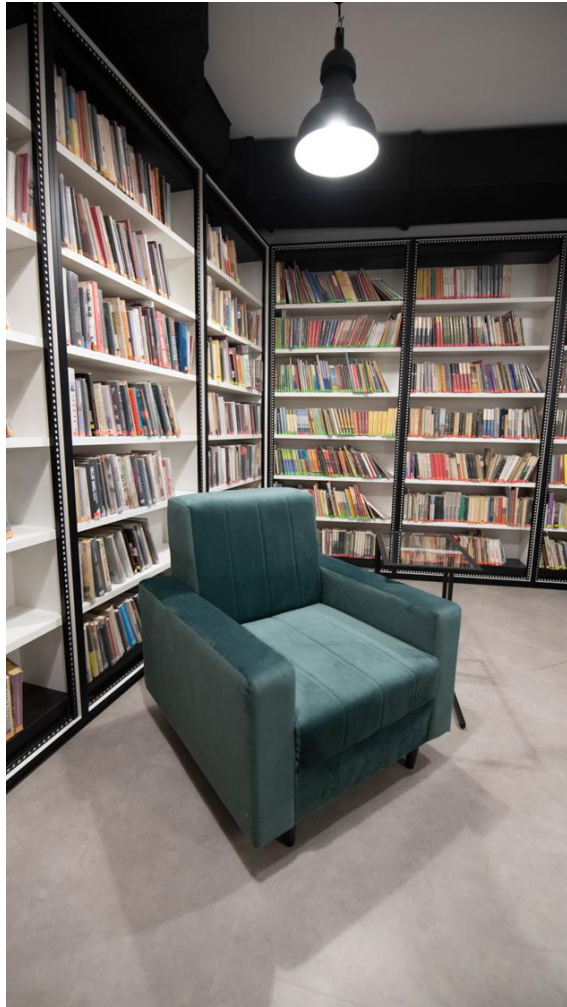
Library in Jarocin