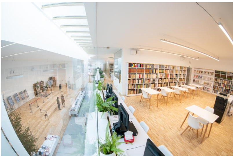
Library in Głuchołazy